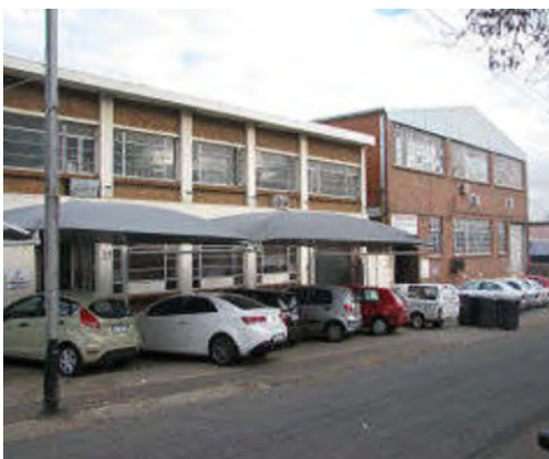
MIMIC COMPONENTS sales@mimic.co.za www.mimic.co.za TEL: (011) 689-5700 5 Ramsay Street, Booyens 2091, Johannesburg P.O. Box 38493, Booyens 2016, Johannesburg, South Africa FAX: (011) 493-8821